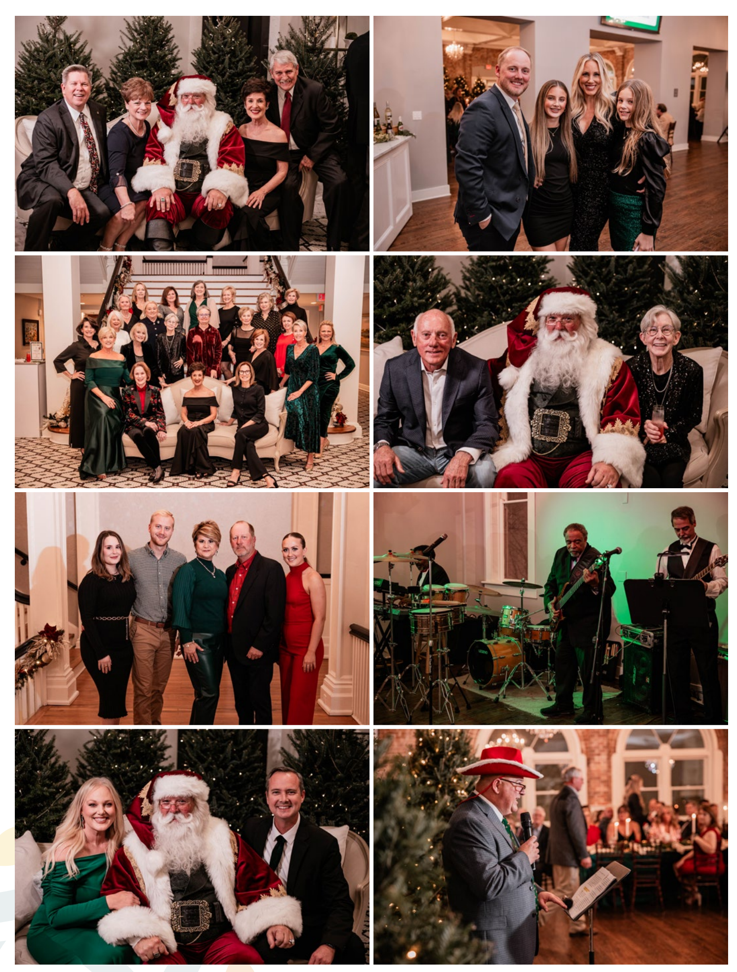
BeYourHaven.org ▶ FEBRUARY/MARCH 2024 ▶ IN TOUCH MAGAZINE ● 13